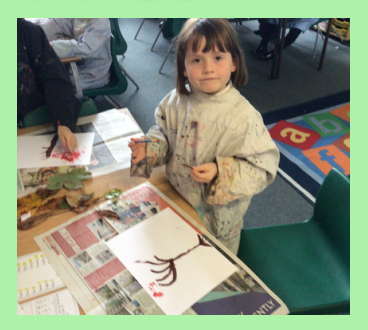
Year 2 paint Harvest pictures.